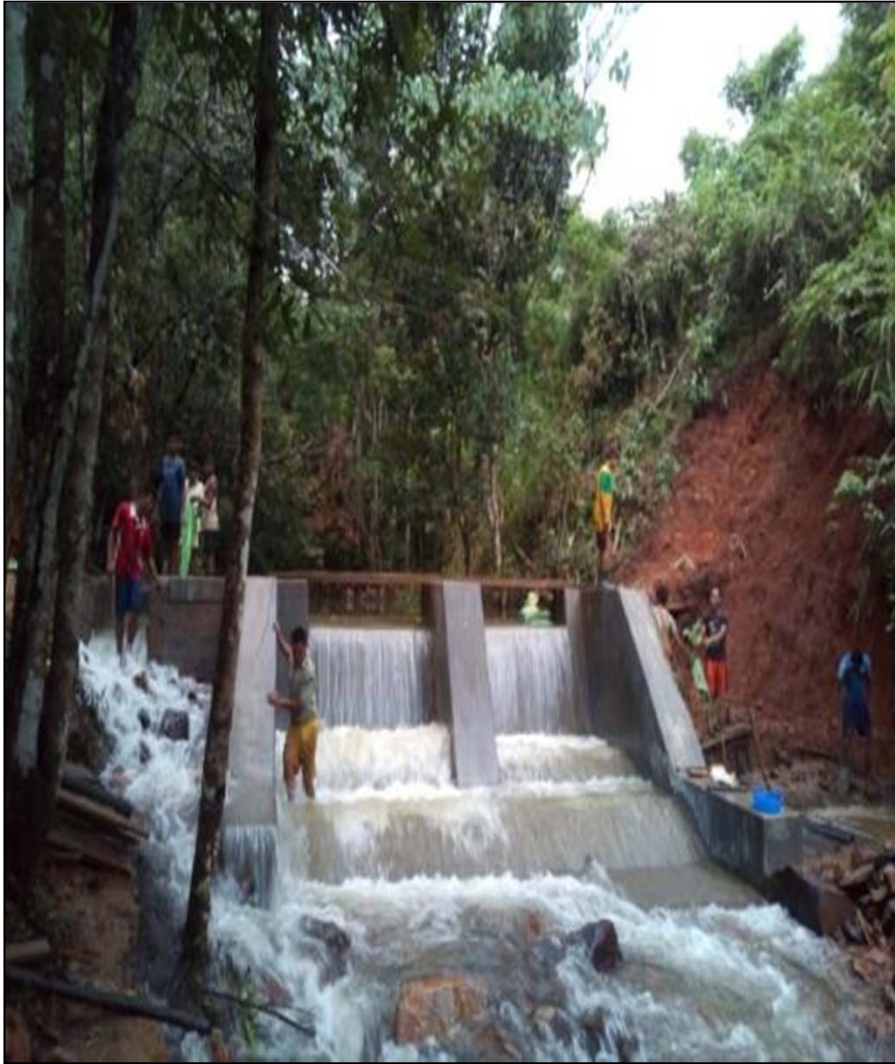
C.C. HEAD WATER DAM AT UMKEI, WAH UMBAM FOREST, RI BHOI