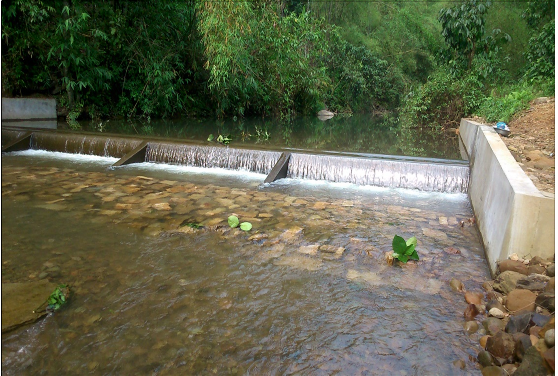
CONSERVATION DAM AT PAR UMKIANG, EAST JAINTIA HILLS