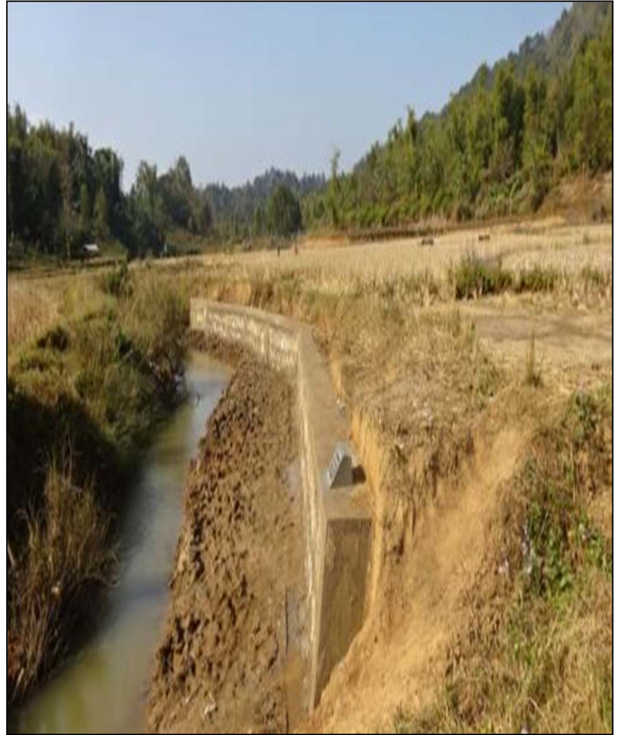
PROTECTION WALL AT SOHLAITRIM, UMSAW, RI BHOI