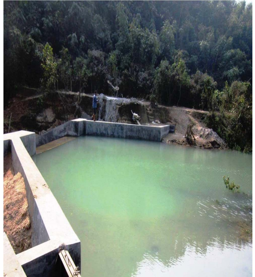
DONGDONGA (AIBP) RCC IRRIGATION DAM AT DONGDONGA, WEST GARO HILLS