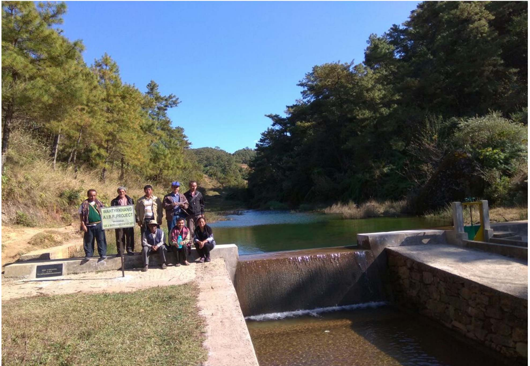
IRRIGATION CHECK DAM AT DOMTOITMAW UNDER WAH TYRKHANG AIBP, EAST KHASI HILLS