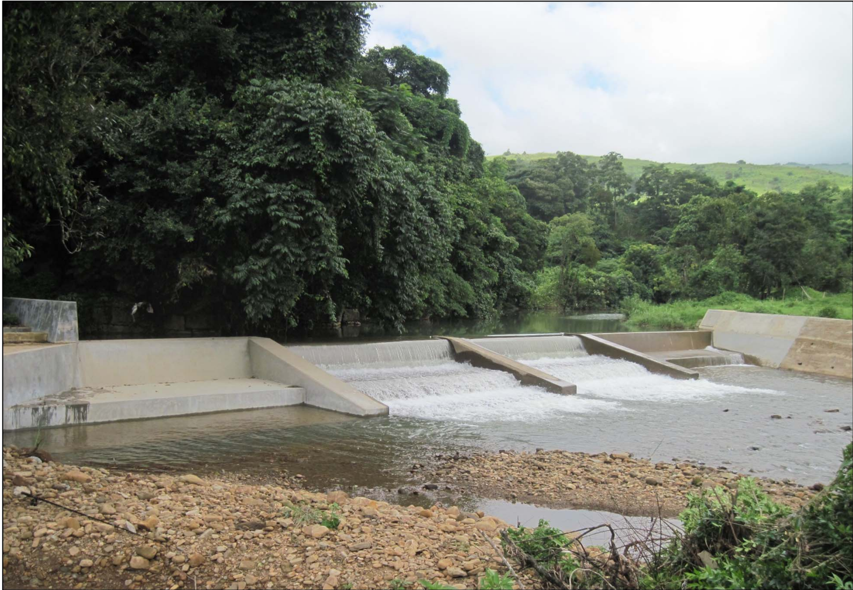
R.C.C DAM AT THWAI SIEJ UNDER LETEIN AIBP, WEST JAINTIA HILLS