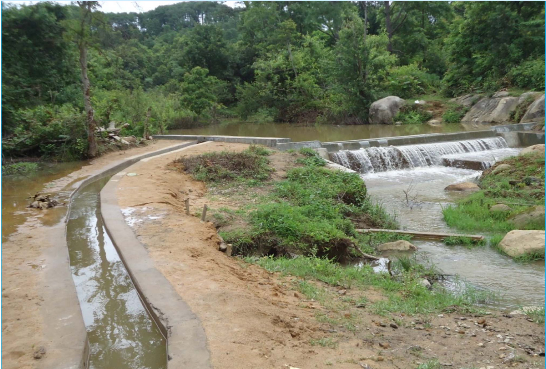
RCC Dam at Wah Yiangkar Cluster under AIBP, West Jaintia Hills