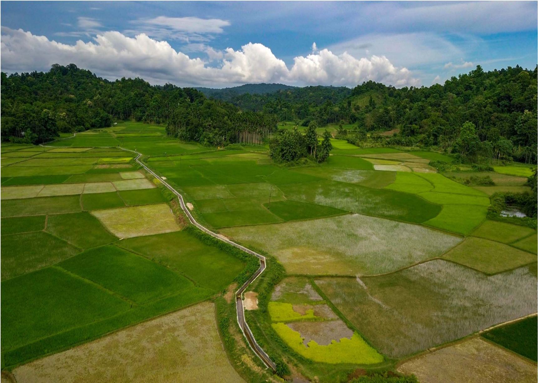
CC PROTECTION WALL CUM CHANNEL AT MEGUA SONGMA UNDER LOWER BUGI AIBP, SOUTH GARO HILLS