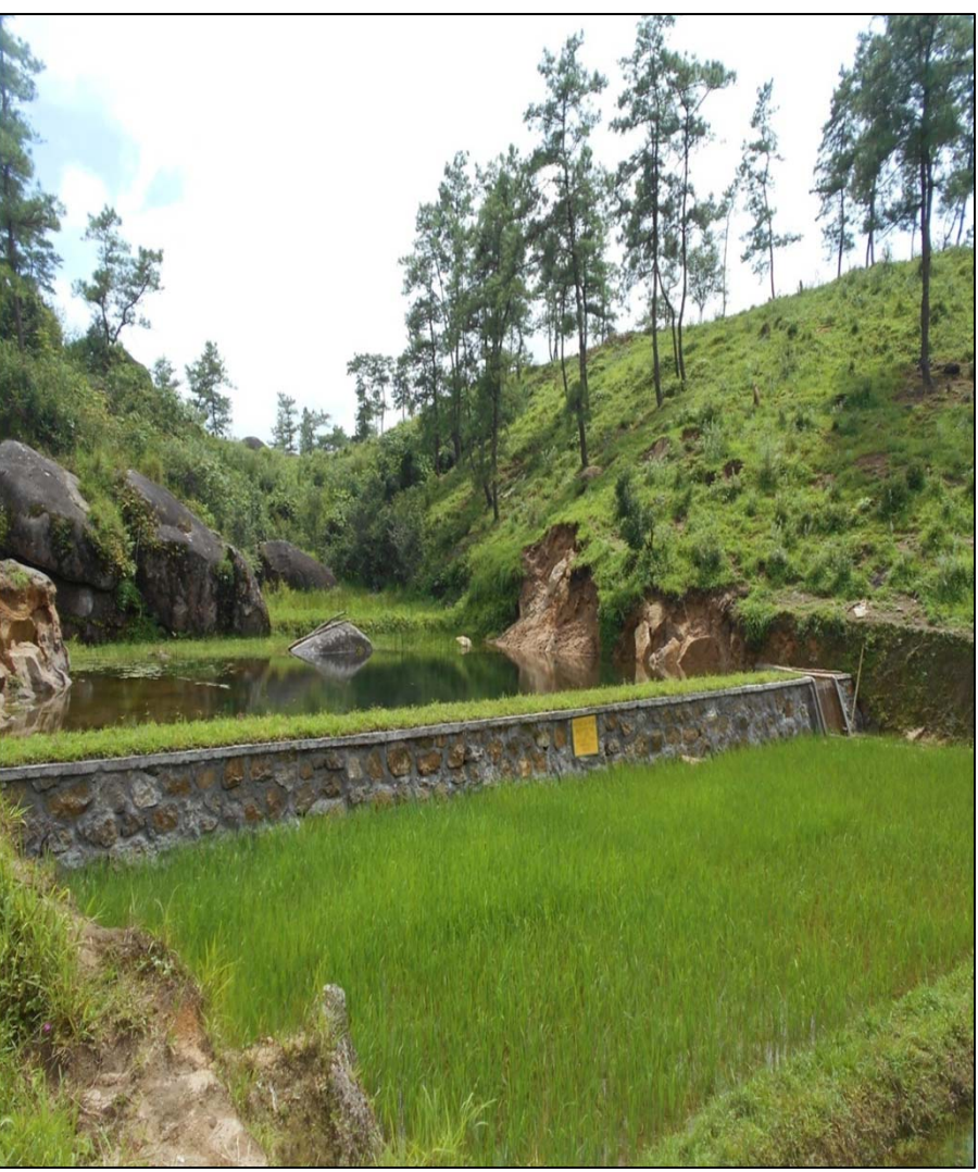
BEFORE CONSTRUCTION AT RANGBLANG NONGTYLLA, SOUTH WEST KHASI HILLS