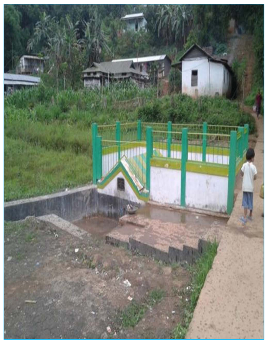
UMHONI-UMPARILA-UMDAIRY RIDF - XX. RCC storage tank for drinking water at Umtarok (Patarim), Ri Bhoi