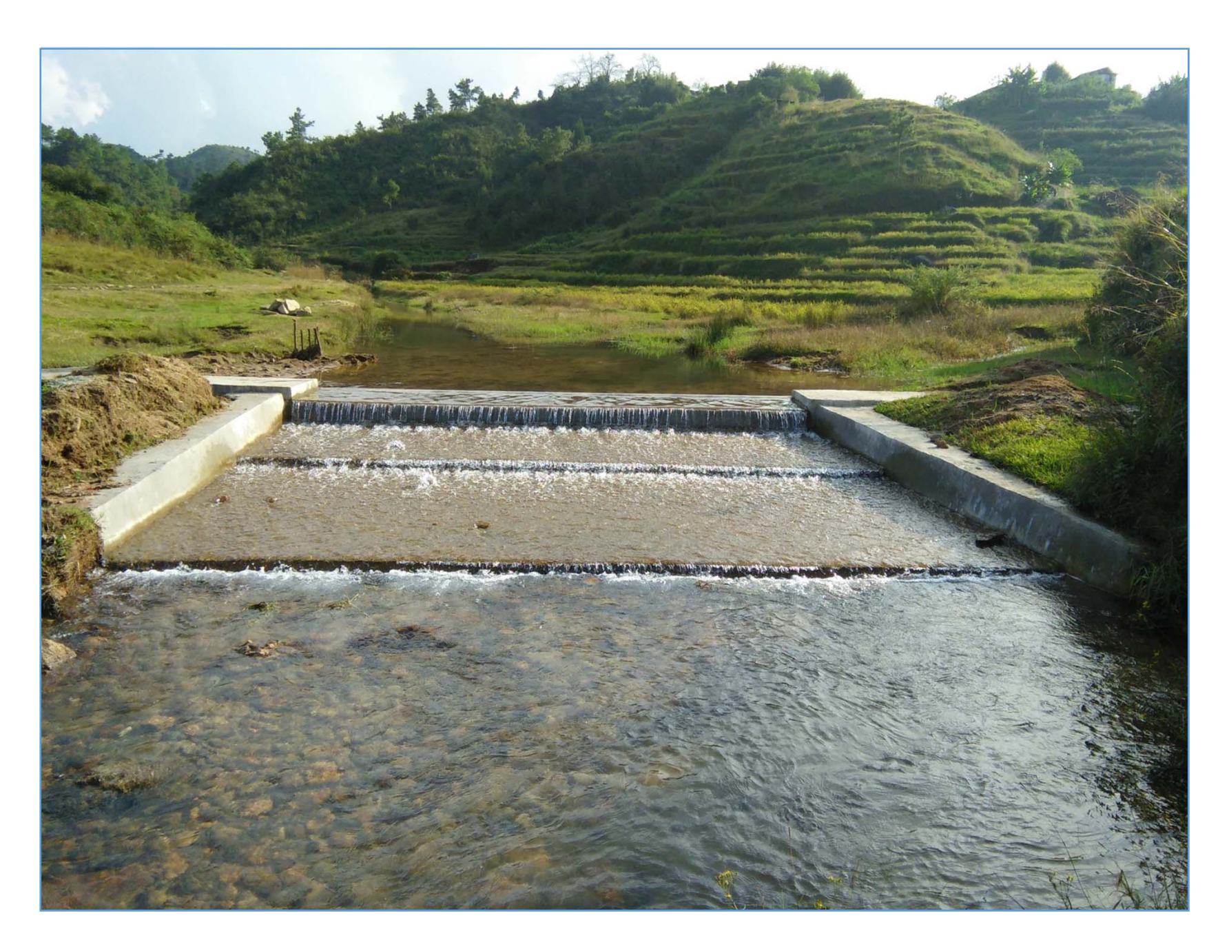
RCC DAM AT UMDIDOH UNDER WAH UMLAWBAH RIDF XX, EAST KHASI HILLS